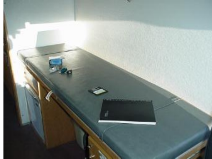
Drug Screen & Blood Draw Station