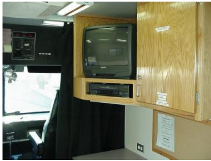
Training & Examination Stations