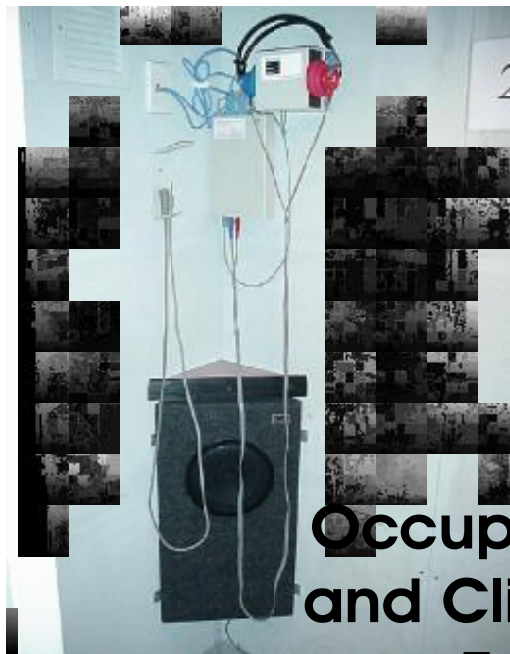
Occupational Hearing and Clinical Audiology Test Systems