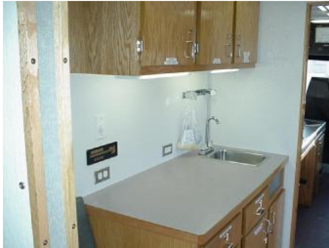
Audiology Hearing Aid Fit Station